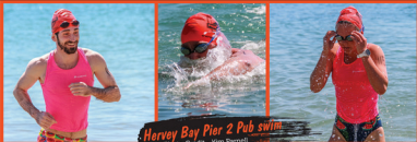
Hervey Bay Pier 2 Pub swim

Stomping Ivories November 2 / 7pm - 10.30pm Hervey Bay RSL 18+ Show