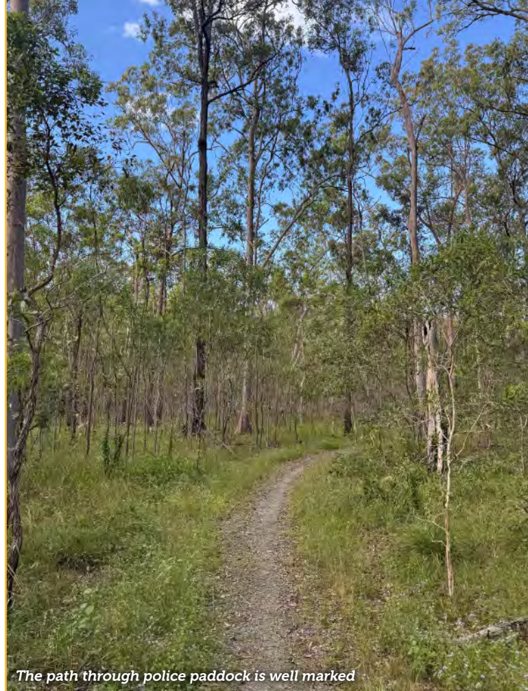
The path through police paddock is well marked

pipes and other building materials arriving at the site, but it was clear that the November finish date was not going to be achieved. Due to favourable developments in the War, there were thoughts of abandoning the Tinana construction, but as it was about halfway finished, it was decided that it would continue albeit at a slower pace and with a revised completion date of 31 January 1944.