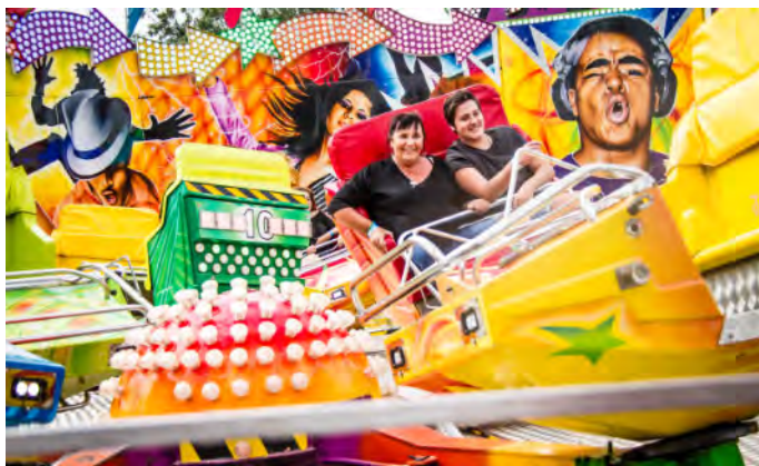
Fraser Coast Agriculture Show 2017