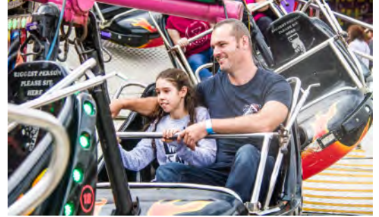
Fraser Coast Agriculture Show 2017

If you have a local story to share, please contact us at whatsonfrasercoast@outlook.com We would love to hear from you.