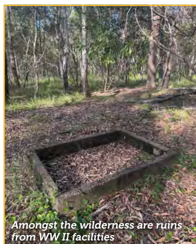
Amongst the wilderness are ruins from WW II facilities

By October there was a stream of prefabricated huts,