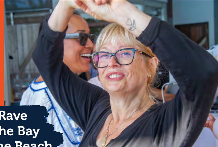
Coffee Rave By Rave the Bay Enzo's on the Beach